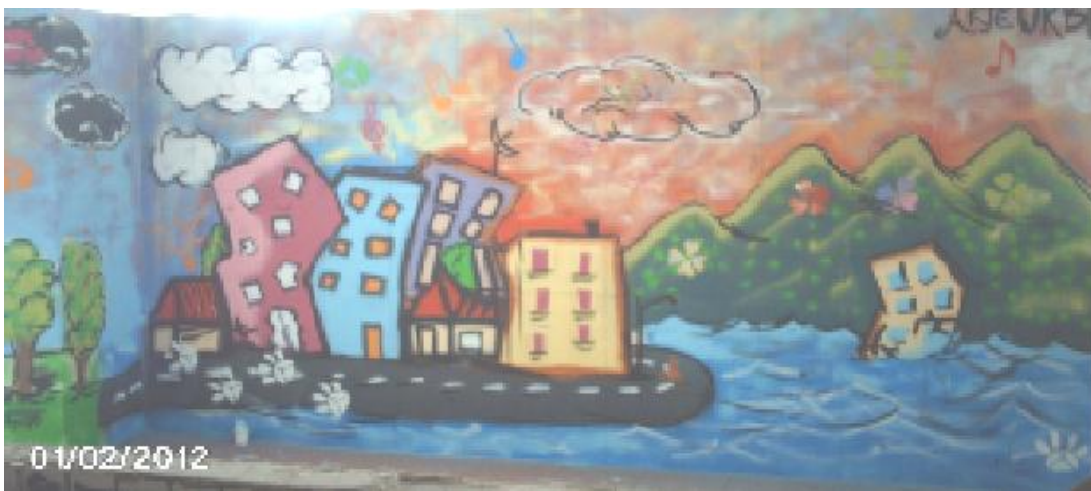
Photo 3. Graphite produced by young participants in one of the editions of Project ArteUrbe.

These other activities are relied on contributions in the area of social psychology that consider the possibility of thinking the group practices “as gadgets 3 – singular combinations and heterogenic components – that open certain fields of visibility and sayability, at the same time they obscure analog fields” (Rodrigues, 1999, p.162). The visibility and sayability that is aimed to invest in aesthetic workshops are from other voices, discordant in relation to forms of seeing and living instituted; voices that concern the possibility of diverse relations with the city, with others and with oneself; that contribute to the invention of singular ways of being, with the come to be.